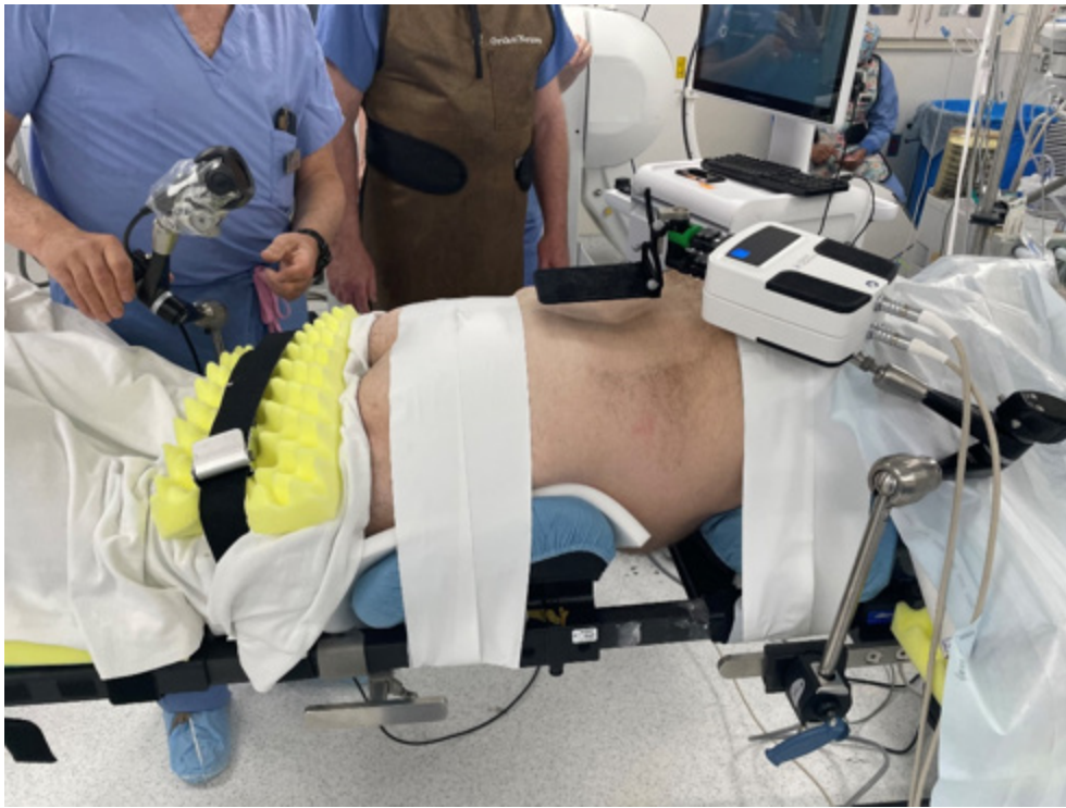
Figure 1. Operating room (OR) setup. The robot is mounted on the surgeon's side of the table just below the patient's axilla, and the camera is mounted on the opposite side of the OR table at the patient's midhigh level and positioned so that the camera view is directed cranially and along the patient's midline.

by mounting the robot and navigation camera to the OR table. Typically, the robot is mounted on the surgeon's side of the table just below the patient's axilla; the camera is mounted on the opposite side of the OR table at the patient's midhigh level and positioned so that the camera view is directed cranially and along the patient's midline (Figure 1). The camera, which is small and unobtrusive, can remain in the field throughout the procedure even if the surgeon is finished using the robot (it can be used for subsequent navigation, if desired). Advantages of this camera are that it has a fish eye view of the entire surgical field, a wide-angle camera lens, and is small enough to be positioned just above the patient and adjacent to the surgical field. This positioning allows the surgical team to freely stand and move around the OR table without interfering with the camera's line of sight. The surgeon has the option of navigation using either 3D imaging (eg, with an O-arm—currently FDA-approved) or multiplanar (eg, anteroposterior and lateral) 2D imaging (with a C-arm fluoroscope—pending FDA approval). The images are imported into the system and automatically registered to the surgical anatomy. Screw trajectory planning is quick and efficient using icons that are dragged into position on the touch screen computer. The surgeon can then rapidly position the robot manually with the assistance of the navigation system, followed by fixing