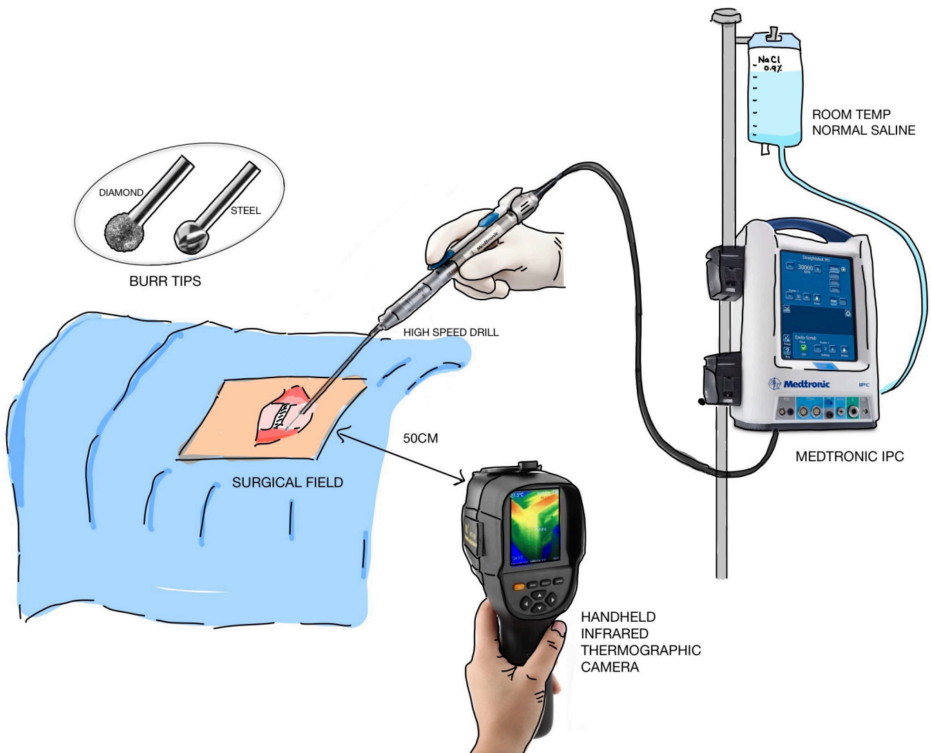
Figure 1. Diagram of the study setup.

rpm. Forward-looking infrared thermography was used in this study for temperature measurements. We used the Hikvision M30 handheld thermal camera (HikMicro, Hangzhou, China) with a resolution of 384 \times 288 (110,592 pixels), a thermal range of -20^{\circ}\text{C} to 550^{\circ}\text{C} with an accuracy of \pm 2\% .