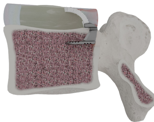
Figure 1. The Barricaid annular closure device.

Revision surgery to correct the reherniation is decidedly more complex and less successful than the primary discectomy procedure. 13 Altered anatomy from the previous surgery and epidural scarring create an unfavorable surgical environment and increase the risk of dural tears and hemorrhage. A wide dissection and extensive bone removal with aggressive facetectomy are often required for visualization and to provide satisfactory decompression of the neural foramen. If extensive decompression is involved, then instrumented spinal