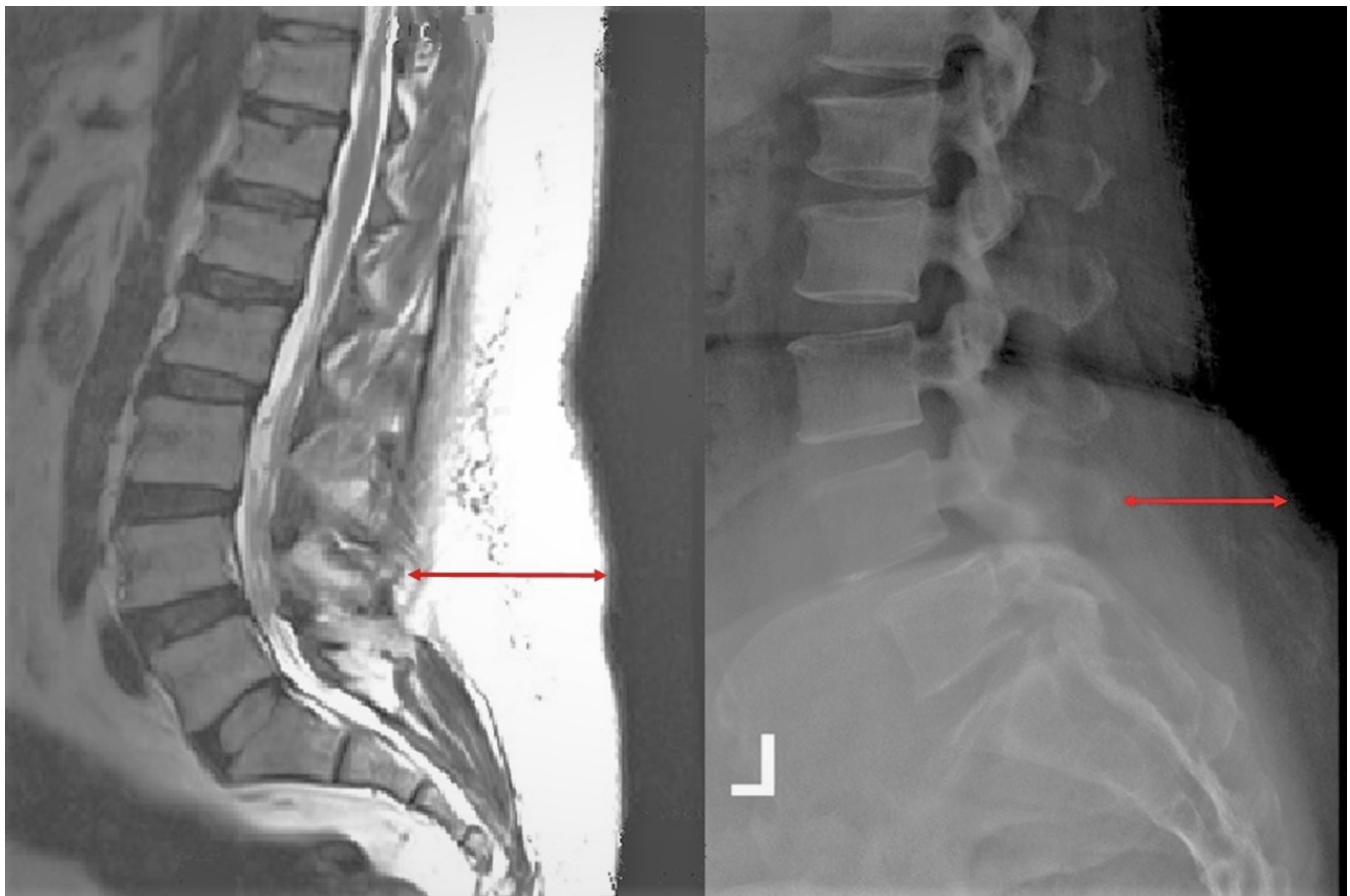
Figure 1. Skin to spinous process measurements at L4 on x-ray imaging and magnetic resonance imaging.

Patients' who developed SSI were defined as those who underwent either reoperation or readmission within 30 days of the initial surgery for infection and had positive tissue cultures proving the diagnosis. Data-points to be collected included demographics, BMI, number of levels fused, estimated blood loss, length of anesthesia, glycemic control, use of drains, skin to SP on standing x-ray imaging, skin to SP on sagittal MRI, skin to SP on axial MRI, and skin to lamina on axial MRI. X-ray imaging was performed using a standard technique, with the elbows flexed and hands on the clavicles. All the measurements were taken at the level of L4 (Figure 1) using the standard imaging viewer software. An orthopedic spine surgeon (AA) took all the measurements and repeated them twice, 1 month apart. Intraobserver reliability using the kappa statistic was performed, and the data found to be very