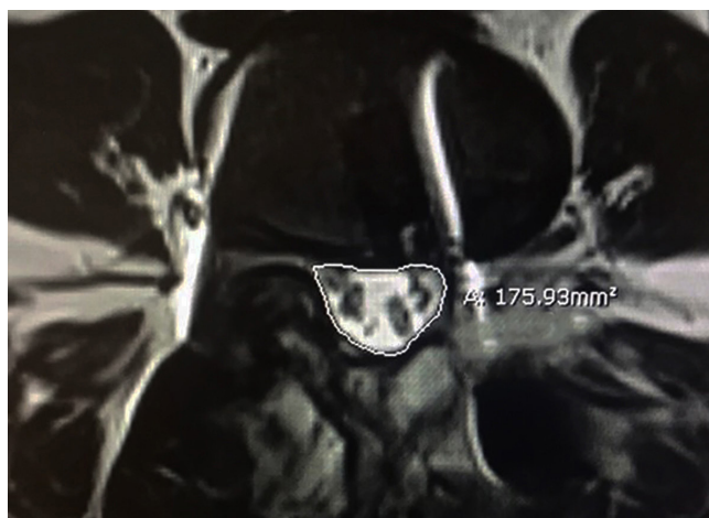
Figure 1. Spinal canal cross-sectional area was measured by drawing the line surrounding spinal canal using digital synapse picture archiving and communication system.

We used picture archiving and communication system program to evaluate the cross-sectional area of the spinal canal on axial view T2-weighted magnetic resonance images at the facet joint level (Figure 1). The area was measured on the preoperative and 3-month postoperative images. The spinal fusion was evaluated by computed tomography images and flexion-extension radiographs 12 months after the operation. Fusion was defined by less than 3-mm translation and 5° angular motion on the flexion-extension radiographs as well as complete bone bridging between the end plates on the computed tomography image. 2,10,11