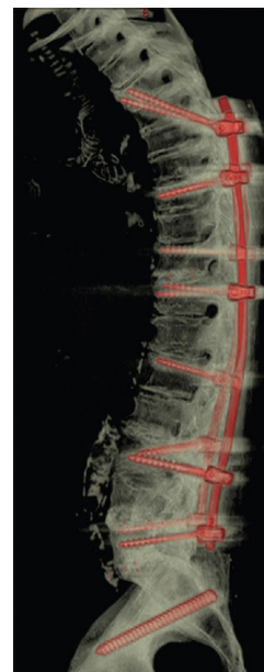
Figure 2. Three-dimensional reconstruction demonstrating a multilevel stabilization screw construct.

Alternative screw techniques at the UIV have been implemented to achieve a similar reduction in construct stiffness. One such technique involves cranially directed transvertebral screws, which are inserted at the inferolateral aspect of the most superior pedicles. The screw is then directed obliquely and superiorly across one or more vertebral levels, depending on the technique. Sandquist et al 35 reported on PJF in a sample of 15 patients who received screws placed with this technique, termed multilevel stabilization screws (MLSSs), with at least 1-year follow-up. A 3-dimensional reconstruction of this technique is shown in Figure 2. 35 None of the 15 patients experienced PJF, and there was an average change in their sagittal Cobb angle of 4^\circ ,