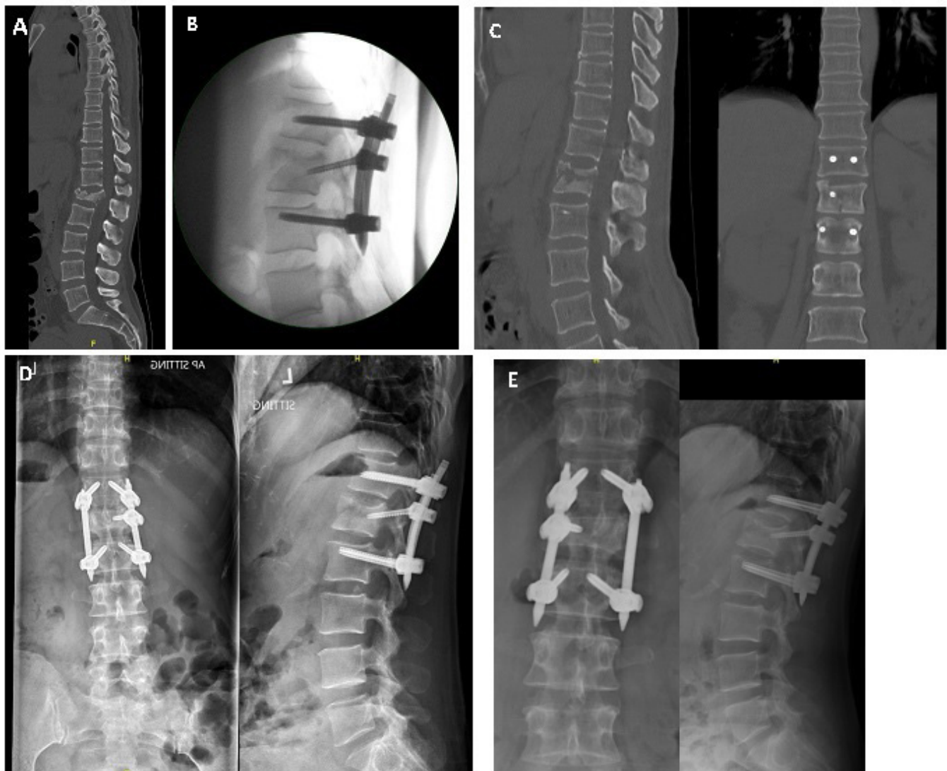
Figure 3. Pre-, intra-, and post-operative radiographs of a patient with flexion distraction injury with burst elements. (A) Preoperative computed tomography (CT), sagittal view. (B) Intraoperative correction sagittal radiograph. (C) Immediate postoperative CT sagittal and coronal views. (D) 6-month follow-up anteroposterior and lateral views. (E) 2-year follow-up anteroposterior and lateral views.

taking into account other injuries comanaged by other specialties. The complete course of a typical patient's correction of the fracture vertebra is highlighted in Figure 3.