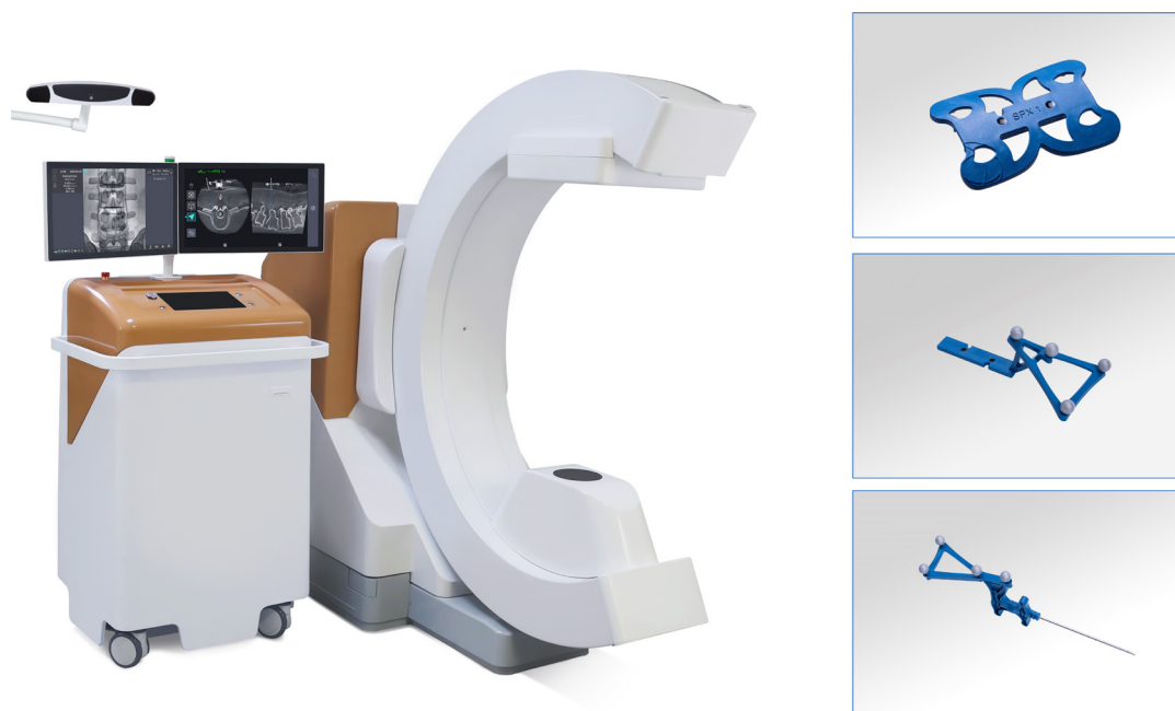
Figure 1. Depiction of the Surgivision surgical platform. Left: Unified platform composed of a C-arm, a navigation station, and an infrared camera. Right: Surgivision disposable instruments (from top to bottom): imaging phantom, patient tracker, and navigated trocar.

has been growing, as several studies have emphasized their role in reducing the overall patient and medical staff radiation dose while achieving accurate needle placement. 8,13 The 2 main factors are high-resolution guidance based on a few 1-time 3-dimensional (3D) image acquisitions (no fluoroscopic controls needed) along with the surgical team leaving the operating room (OR) during the image acquisition process. This supports the “as low as reasonably achievable” radio-protection principle and the implementation of diagnostic reference levels in different countries 14,15 to increase awareness.