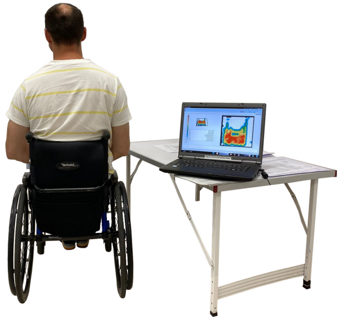
Figure 1. Measurement setup. Measurements were taken using a pressure mat (BodiTrak2, 16 \times 16 = 256 sensors) placed on the participants own seat cushion in their own wheelchair. Using the standard supplied FSA.1 software package, the following parameters were measured: maximum pressure (mm Hg), mean pressure (mm Hg), measurement area ( \text{cm}^2 ) as well as the coordinates of the center of pressure (cm).

An a priori power analysis for an analysis of variance model conducted by means of G*Power 3.1.5 software revealed the necessity of 34 participants given the following input parameters: effect size F = 0.4 (detectable), alpha error probability: 0.05, power: 0.8, and number of groups: 1. To gather the relevant information about the characteristics of the participants, we collected their weight, height, age, gender, level and severity of lesion (American Spinal Injury Association Impairment Scale), behavior in the wheelchair (ie, able or unable to reposition themselves in the wheelchair as needed and desired), and cushion type.