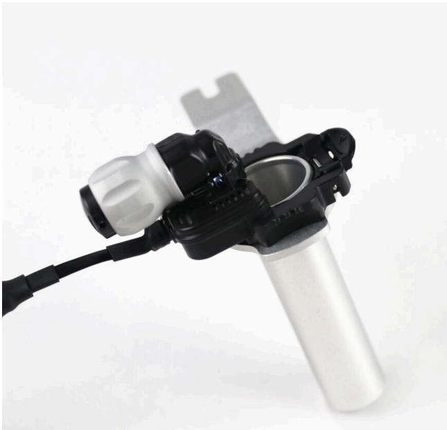
Figure 2. High-definition digital camera mounted to a tubular retractor (Viseon MaxView Posterior).