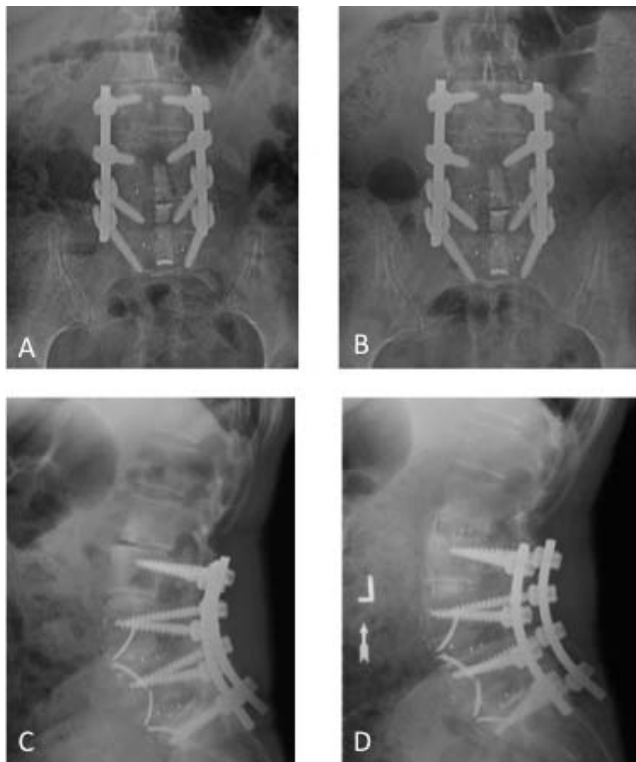
Figure 1. Case example of lumbar interbody fusion (LIF). Preoperative anterior-posterior (A) and lateral (C) radiographs demonstrate disc collapse at L2/3 secondary to adjacent segment disease (ASD). Postoperative anterior-posterior (B) and lateral (D) radiographs demonstrate restoration of disc height.

benefits of less estimated blood loss and shorter length of stay.