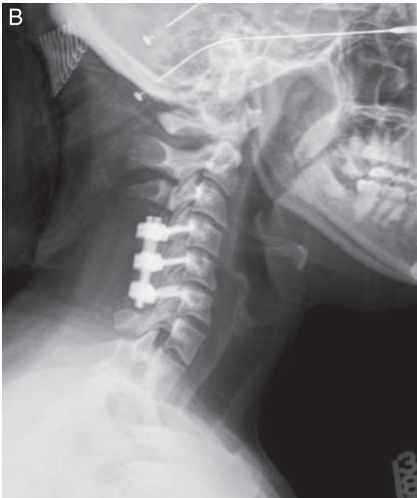
Figure 3. (A) Anteroposterior and (B) lateral upright cervical spine radiographs demonstrating C4 through C6 posterior cervical decompression and fusion.

1.2, and platelet count of 177 \times 10^3/\mu L . Given the patient's acute neurologic deficits in correlation with MRI findings that raised concerns for SSEH, the patient was taken for emergent surgical intervention. A large left-sided, congealed epidural hematoma was encountered that required bilateral C4-C6 laminectomy and C7 dome laminectomy for full evacuation. No vascular malformation or active bleeding source was identified. A C4 through C6