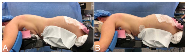
Figure 1. Patient positioned on hinged surgical table with table flexed at 20° (A) and table at 0° (B).

In the second cohort (group 2), the patients were positioned on the hinged surgical table. The table was flexed at 10°–24° to increase lumbar kyphosis and improve exposure for decompression and placement of pedicle screws and interbody grafts (Figure 1A). After the PCO was performed and the interbody graft was placed, the table was returned to the neutral position (0°; Figure 1B). This closed the osteotomy adequately and allowed compression across the interbody graft. No manual compression