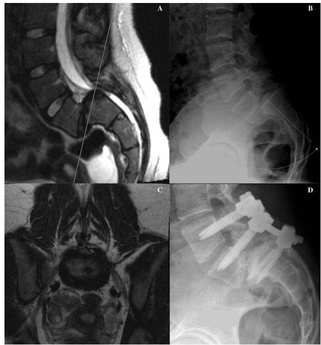
Figure 4. This is a 14-year-old gymnast presented with chronic lower back pain without radicular symptoms. The (a) T2-weighted lumbar magnetic resonance (MR) image and (b) lateral neutral lumbar plain radiograph show exaggerated lordosis and a grade III spondylolisthesis in addition to mild posterior wedging of L5 and mild deformity of the superior S1 end plate. (c) The axial T2-weighted MR image at L5-S1 depicts severe deformity at this level. (d) The patient underwent a laminectomy at L4-S1 with a posterolateral fusion at L4-5 and transforaminal lumbar interbody fusion (TLIF) at L5-S1 following a reduction attempt at L5-S1.

The partial reduction and fusion is an adaptation of the reduction and fusion procedure with advantages that include increased fusion rates in patients with an unbalanced pelvis and lower risks of complications compared with a full reduction (Figure 4). 73,74 In this technique, the patient is positioned prone and intraoperative monitoring such as somatosensory evoked potentials or electromyography is used throughout the procedure. The L4-S2 segments are exposed, and a complete L5 laminectomy, and wide decompression of the bilateral L5 and S1 nerve roots is performed. Subsequently, a L5-S1 discectomy and partial excision of the sacral dome is completed to shorten the L5-S1 segment. Pedicle screws are then placed at L4, L5, and S1. A gradual reduction with cantilever flexion of the sacral-pelvis unit follows via a combination of patient positioning and gentle downward force on the sacrum. This