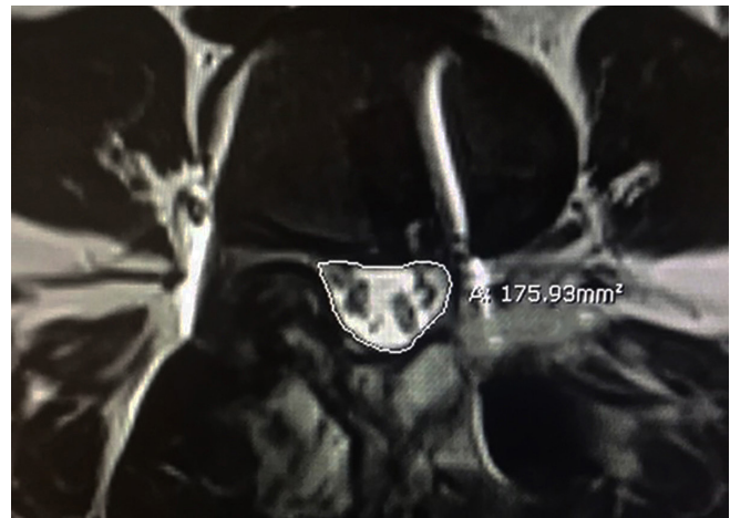
Figure 1. Spinal canal cross-sectional area was measured by drawing the line surrounding spinal canal using digital synapse picture archiving and communication system.

We used picture archiving and communication system program to evaluate the cross-sectional area of the spinal canal on axial view T2-weighted magnetic resonance images at the facet joint level (Figure 1). The area was measured on the preoperative and 3-month postoperative images. The spinal fusion was evaluated by computed tomography images and flexion-extension radiographs 12 months after the operation. Fusion was defined by less than 3-mm translation and 5° angular motion on the flexion-extension radiographs as well as complete bone bridging between the end plates on the computed tomography image. 2,10,11