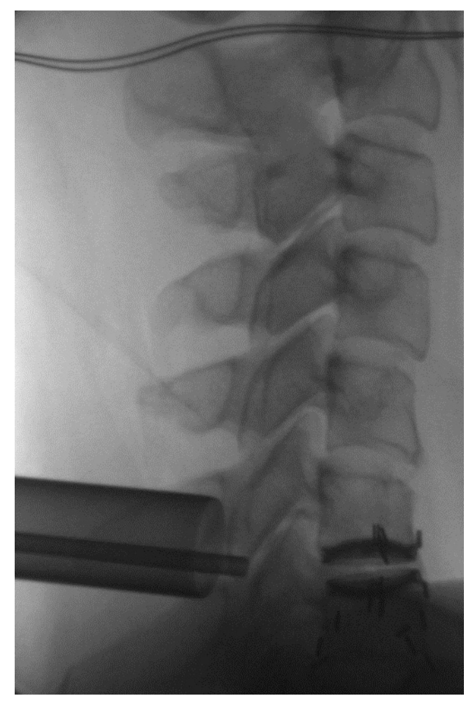
Figure 3. Tubular posterior laminoforaminotomy following cervical artificial disc replacement.

FDK (Figure 1) is another complication that also does not necessarily have a clinical correlate but limits motion. FDK may rarely lead to dislocation and core expulsion. Biomechanically, devices with less constraint may predispose to FDK, especially in "off-label" adjacent to fusion indications. Using more constrained