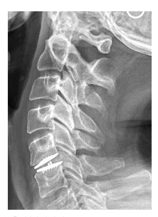
Figure 1. Focal device kyphosis.