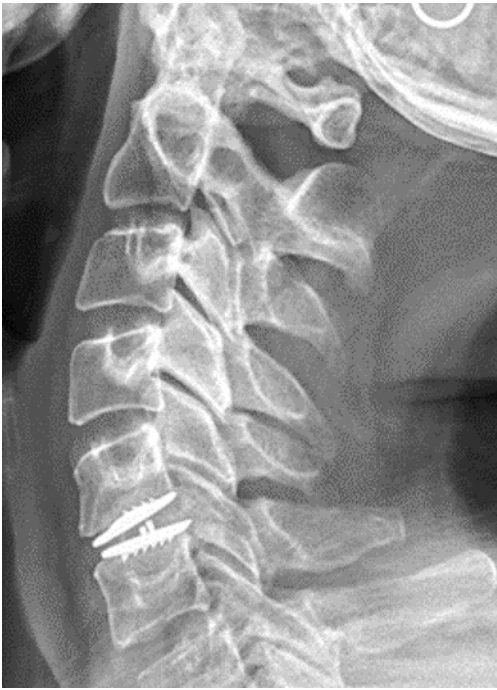
Figure 1. Focal device kyphosis.