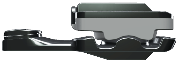
Figure 3. The MOTUS device (3Spine, Chattanooga, TN, USA).

Initial clinical results with this implant have been encouraging. In a propensity-matched study comparing 156 TLIF-treated patients with 52 implant-treated