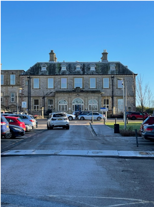
Figure 1. The facade of Wrightington Hospital appears today very much the same as it did in the time of Sir John Charnley.

However, despite spinal arthrodesis being embedded in the surgical arsenal as a viable treatment option, the consequences of fusing a motion segment and fundamentally altering its biomechanics began to be appreciated over time. Because of the stress associated with rigid fixation and fusion, a new condition, adjacent segment disease , emerged. 53,54 Additionally, the persistent concern of instrumentation failure, implant subsidence, and pedicle screw breakage with recurrent symptoms developed. 55-57 Most importantly perhaps is the growing body of evidence suggesting that instrumented spinal fusion in many cases does not offer additional patient benefit above and beyond that provided by decompression alone. 50,58-60