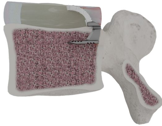
Figure 1. The Barricaid annular closure device.

Revision surgery to correct the reherniation is decidedly more complex and less successful than the primary discectomy procedure. 13 Altered anatomy from the previous surgery and epidural scarring create an unfavorable surgical environment and increase the risk of dural tears and hemorrhage. A wide dissection and extensive bone removal with aggressive facetectomy are often required for visualization and to provide satisfactory decompression of the neural foramen. If extensive decompression is involved, then instrumented spinal fusion may be warranted to provide necessary