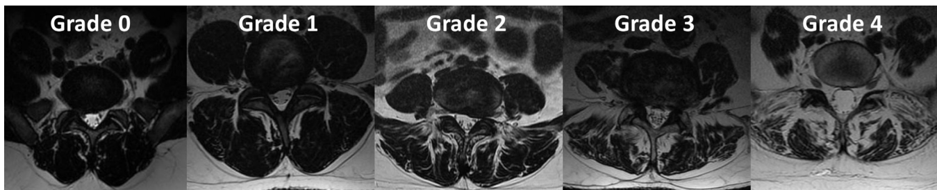
Figure 1. Image representation of the modified Goutallier scale: grade 0 indicates no intramuscular fat; grade 1 indicates some fatty streaks present; grade 2 indicates fat that is evident but less than muscle tissue; grade 3 indicates amounts of fat that are equal to the amount of muscle; and grade 4 indicates more fat than muscle tissue.

intramuscular fat; grade 1 indicates some fatty streaks present; grade 2 indicates fat that is evident but less than muscle tissue; grade 3 indicates amounts of fat that are equal to the amount of muscle; and grade 4 indicates more fat than muscle tissue (Figure 1). 14