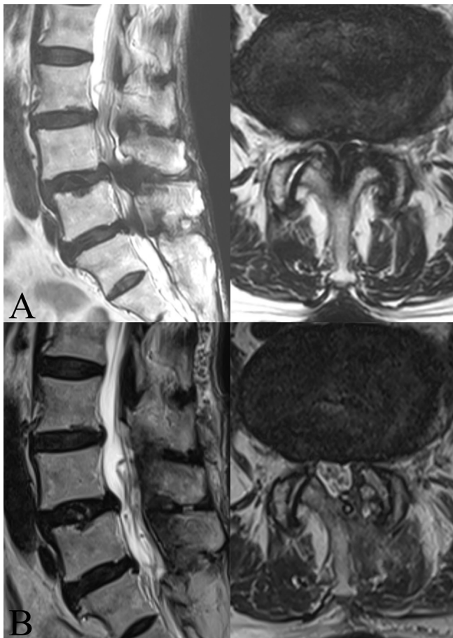
Figure 1. Biportal endoscopic decompressive laminectomy in a 92-year-old woman. (A) Magnetic resonance image (MRI) showing severe central canal stenosis at the L4–L5 and L5–S1 level and moderate central canal stenosis at the L3–L4 level. (B) Postoperative MRI showed fully decompressed dura after surgery.

Patient-reported outcome measures were evaluated at 4 time points: preoperative (baseline), and at 3, 6, and 12 months postsurgery. Clinical assessments included the visual analog scale (VAS) for low back pain and radiating pain in the lower extremities, the Oswestry Disability Index (ODI), 17 the European Quality of Life-5 Dimensions (EQ-5D) score, 18 and the painDETECT questionnaire. 19