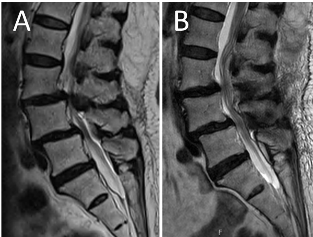
Figure 3. (A) Preoperative magnetic resonance image (MRI) of the lumbar spine (sagittal) demonstrating canal stenosis at L3/4 and L4/5 with grade 1 anterolisthesis of L4 on L5. (B) Postoperative MRI of the lumbar spine (sagittal) demonstrating decompression of the spinal canal at L3/4 and L4/5 without an identifiable structural cause for her foot drop. High irrigation pressures (sustained >50 mm Hg) were deemed to be the cause of the neurological deterioration.

laminotomy (Matrix Endoscopy, 8.4 mm stenosis scope) with bilateral decompression was performed. A right-sided hemilaminotomy and medial facetectomy were performed with contralateral decompression. Postoperatively, the patient developed a right-sided foot drop (MRC 3). An MRI of the lumbar spine was performed on postoperative day 1 and did not demonstrate an identifiable structural cause for her ankle dorsiflexion weakness. There was satisfactory decompression of the L3/4 and L4/5 spinal canal and lateral recesses (Figure 3). She was examined by the primary surgeon (R.J.M.) at 6-week postoperative follow-up, where she had partial recovery of her right-sided ankle dorsiflexion weakness (MRC 4+).