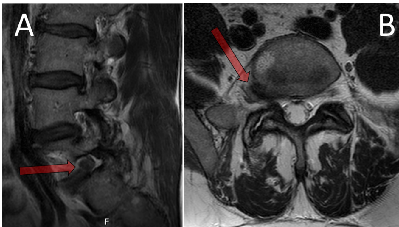
Figure 2. (A) Magnetic resonance image (MRI) of the lumbar spine (sagittal) demonstrating L5/S1 foraminal disc herniation (red arrow) compressing the exiting L5 nerve root. (B) MRI of the lumbar spine (axial) demonstrating the same right-sided L5/S1 foraminal disc herniation (red arrow).

A 76-year-old woman presented with neurogenic claudication. MRI of the lumbar spine demonstrated significant spinal canal stenosis at L3/4 and L4/5 secondary to hypertrophy of the ligamentum flavum, facet joints, and disc bulging (Figure 3). An endoscopic right-sided hemi