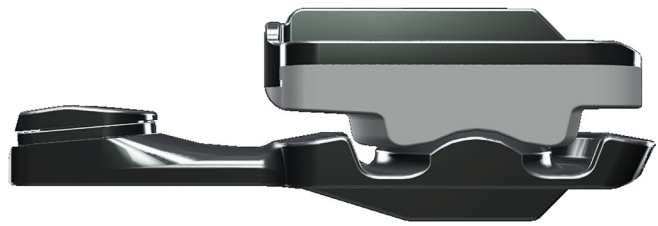
Figure 1. The MOTUS device (3Spine, Chattanooga, TN, USA).

TJR of the lumbar spine combines the clinical benefits of neural decompression with the maintenance of natural motion at the operative level with the implant functioning biomechanically as a new articulation for the resected disc and facets. Laminectomy, bilateral facet removal, and discectomy are used to achieve a