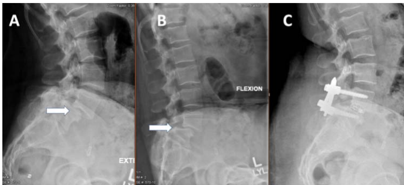
Figure 2. Preoperative (A) extension and (B) flexion films demonstrating a Grade 2 spondylolisthesis; (C) postoperative lateral radiograph showing good reduction of a Grade 2 lumbar spondylolisthesis using the FlareHawk cage.