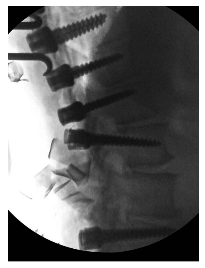
Figure 1. Intraoperative lateral image with pedicle screws placed (except at L2).

disarticulation of the deformed spine through a VCR. A PSO has been reported to result in a correction of approximately 30 degrees. Depending on the severity of the deformity and the familiarity of the procedure, the surgeon may choose one osteotomy over another or a combination of osteotomies.