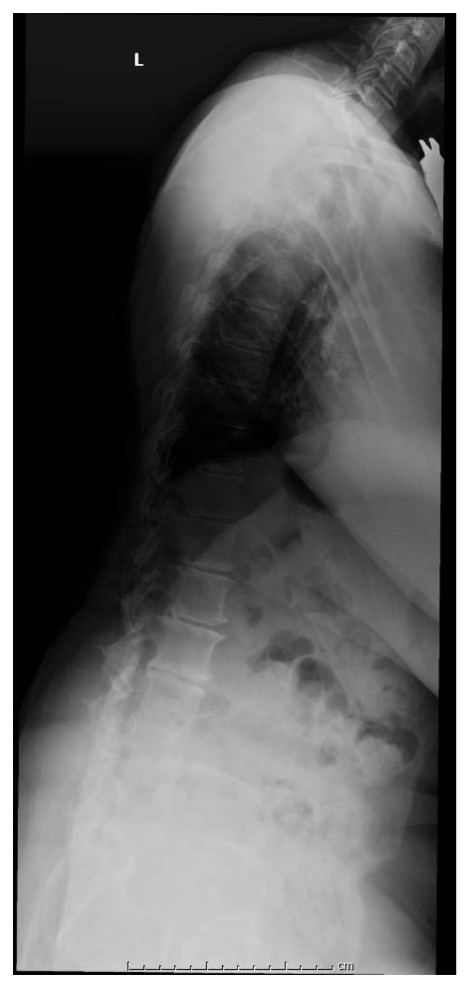
Figure 3. Preoperative standing lateral x-ray showing flat back deformity, sagittal vertical axis of +16.2 cm.

of osteotomy and part of the lamina caudal and cephalic to it. In case of previous decompression, an attempt was made to remove/debulk the scar tissue as much as safely possible. Transverse processes were taken down with an osteotome. The pedicle was taken down to the level of the body. Decancellation of the body was completed in the posterior two-thirds. The lateral vertebral wall was